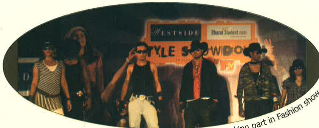
ISBR Students taking part in Fashion show

Lastly on behalf of the fashion show team, we would like to thank the management for helping to tap the potential of students and for showcasing our talents.