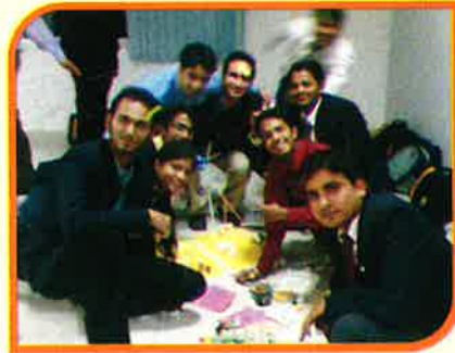
ISBR Students in INNOVATION WORKSHOP

Overall it was a wonderful experience for the students of ISBR as they learned a lot from this innovation workshop. i.e., how to think of an idea and how to bring that idea into reality.